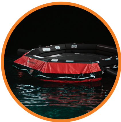
REPLICA OF HELIRRAFT