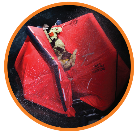
DESIGNED FOR RE-USE