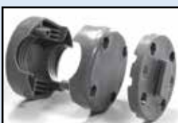
99824 Rail Support Base for "Store-All" Cases - Graphite

The 71325 & 71326 holding base can be self mounted or combined with "Store All" support's