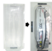
Plastic Cover for EEBD